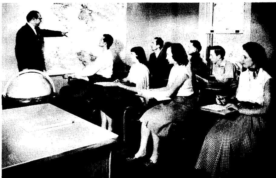
An Ambassador College class in session—reflecting the excellent faculty-student ratio which facilitates personalized instruction.

But there is one college which is awake to the evils of this world's education. It has set out to correct these errors by imparting the knowledge of the purposes of human existence—by objec-