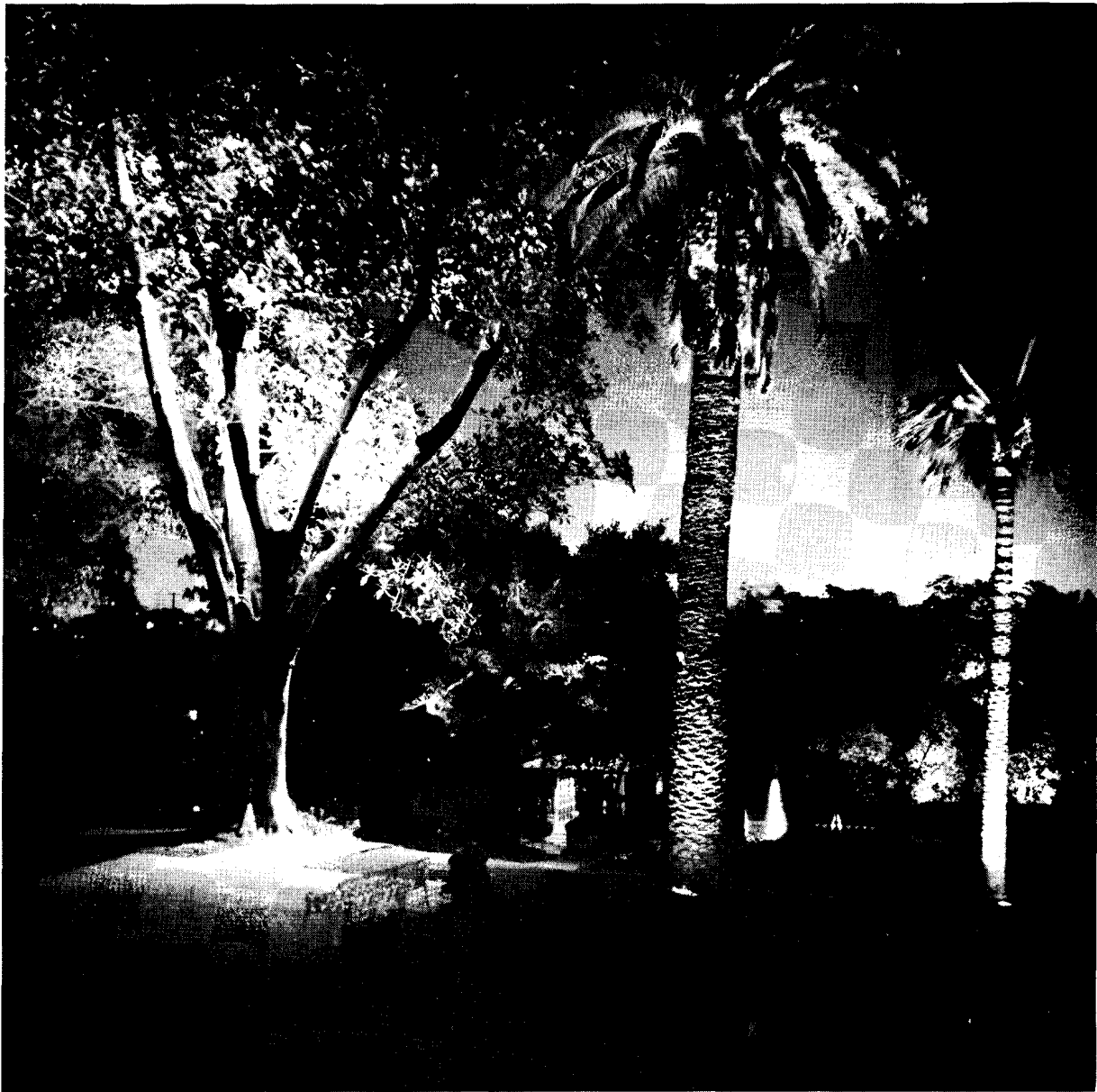
Night lighting creates this enchanting view of AMBASSADOR COLLEGE campus